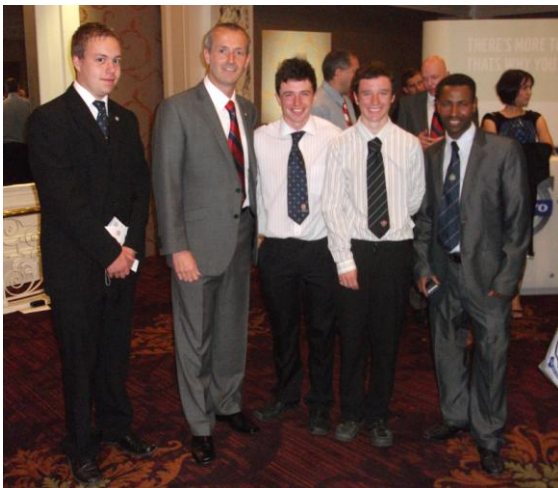
Martin Atkinson with young members at the Rally

Various luminaries for the evening began to arrive including David Elleray and Neale Barry, as well as former cup final officials, who were coming to support their colleagues the night before the biggest game of their lives.