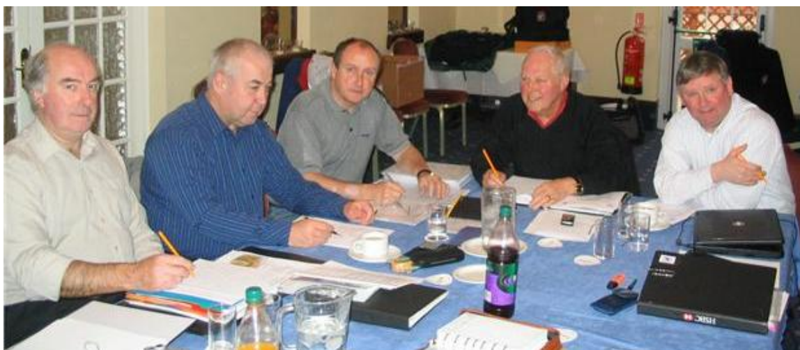
ICC in action L to R